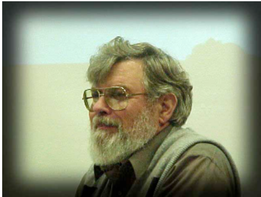
Fig. 5. Image with burned-in edge

The finished image with burned-in edges appears in Fig. 5. I used a Feathering figure of 20 to make the burned-in edge appear more definite. Your choice. If you use a figure in the 40-50 range, the effect will be far more subtle. You can also play with the opacity percentage to see what you like best.