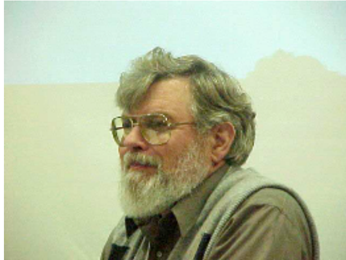
Fig. 1. Image to receive burned-in edge

It is easy to produce a burned-in edge for an image in Photoshop. A burned-in edge is a dark feathered edge around an image. Lets start with this image, Fig. 1.