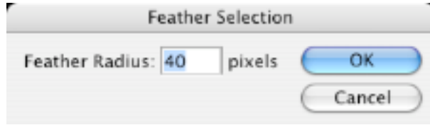
Fig. 3. Feathering

Press Delete to reveal your feathered image. Press Command + D to deselect the marquee. Now go to the Layers palette and lower the opacity to 50%, Fig. 4.